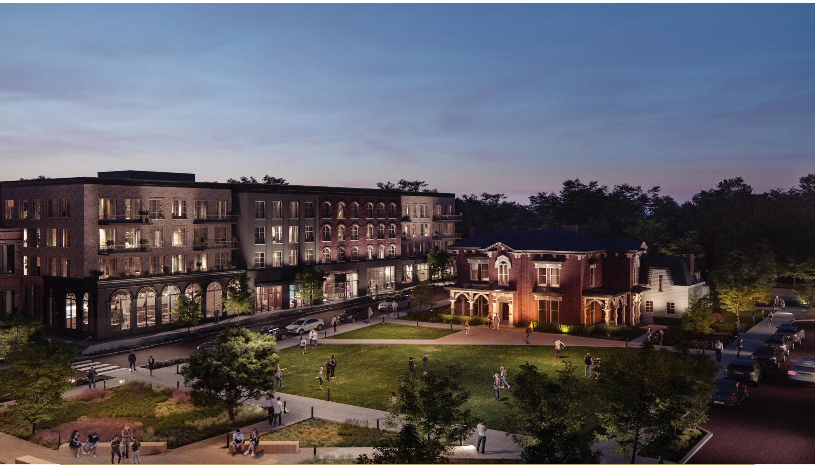
Mixed-Use Opportunity Zone Development in Nashville